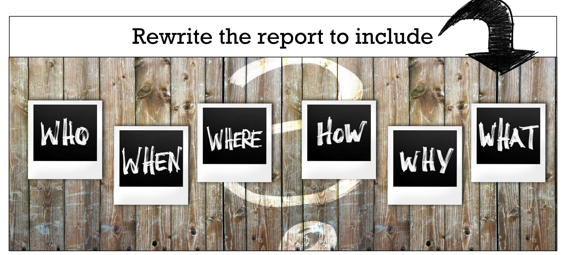
Make sure it is clear, concise, and well-organized