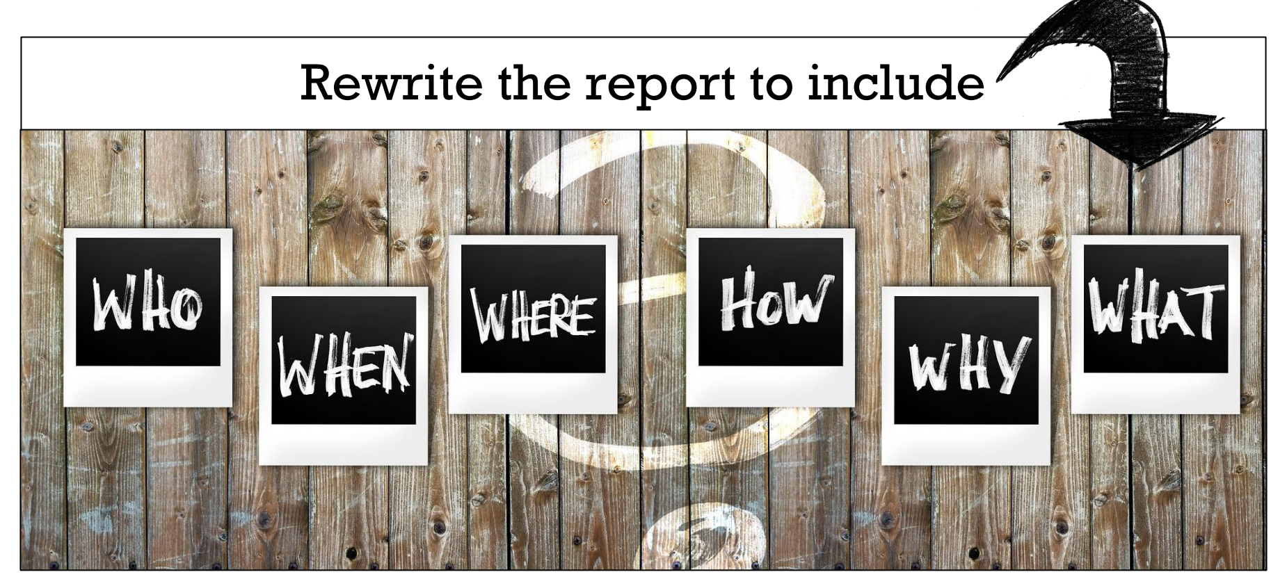
Make sure it is clear, concise, and well-organized